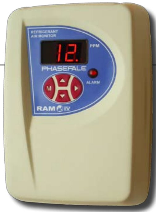
Main Controller Part RAMiv9